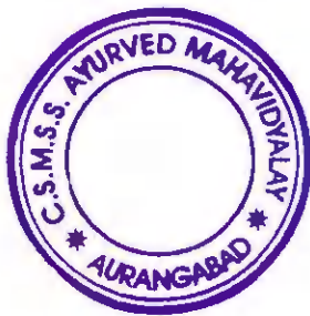
Principal C.S.M.S.G. Ayurved Mahavidyalaya, Kanchanwadi, Aurangabad.

Mock Drill –A. Neurogenic shock treatment and wound management.