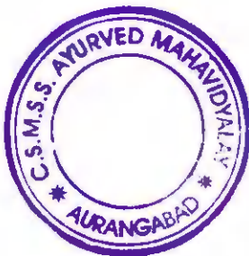
Principal C.S.M.S.S. Ayurved Mahavidyalaya, Kanchanwadi, Aurangabad.

Patient informed to medical officer and concern authority immediately.