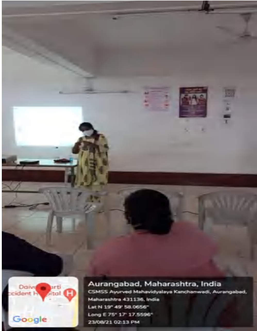
Training Program of New Born Baby Care