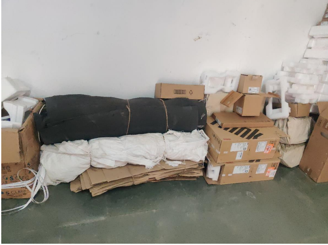
Solid Waste Management