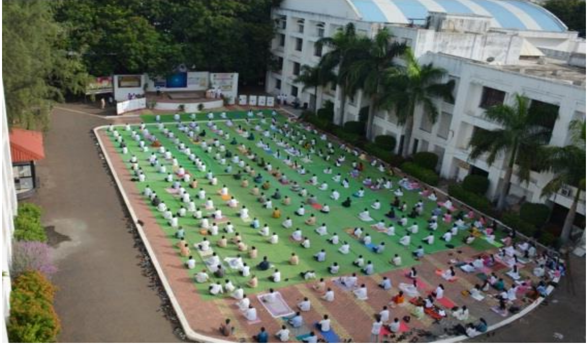
8 th IYD Event