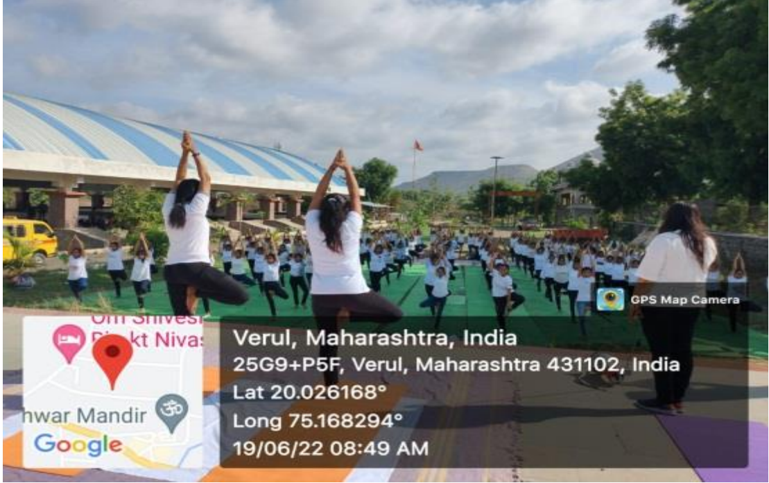
Ellora Yoga Demonstration