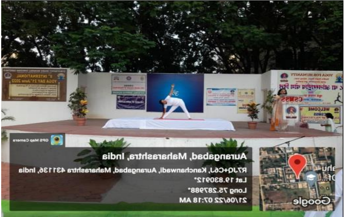
8 th IYD Event

Address : Kanchanwadi, Paithan Road, Chhatrapati Sambhajanagar- 431 011. (M.S.) कांचनवाडी, पैठण रोड, छत्रपती संभाजीनगर -४३१ ०११ (एम.एस.)