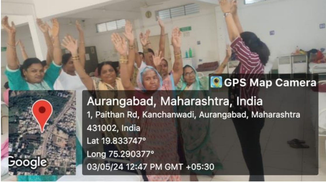
Yoga for common people