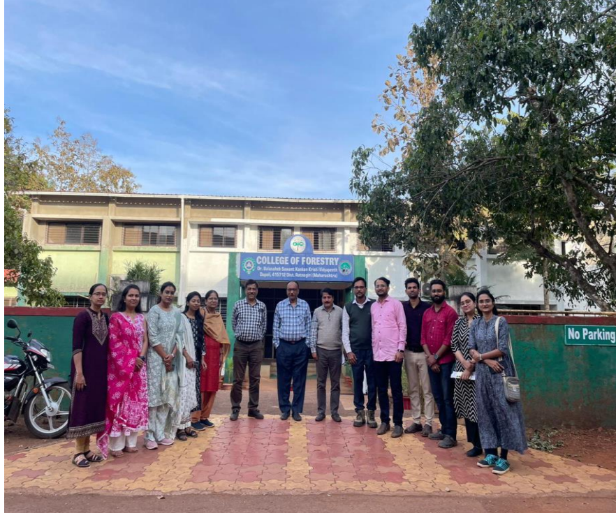
Plant exhibition at maha arogya shibir