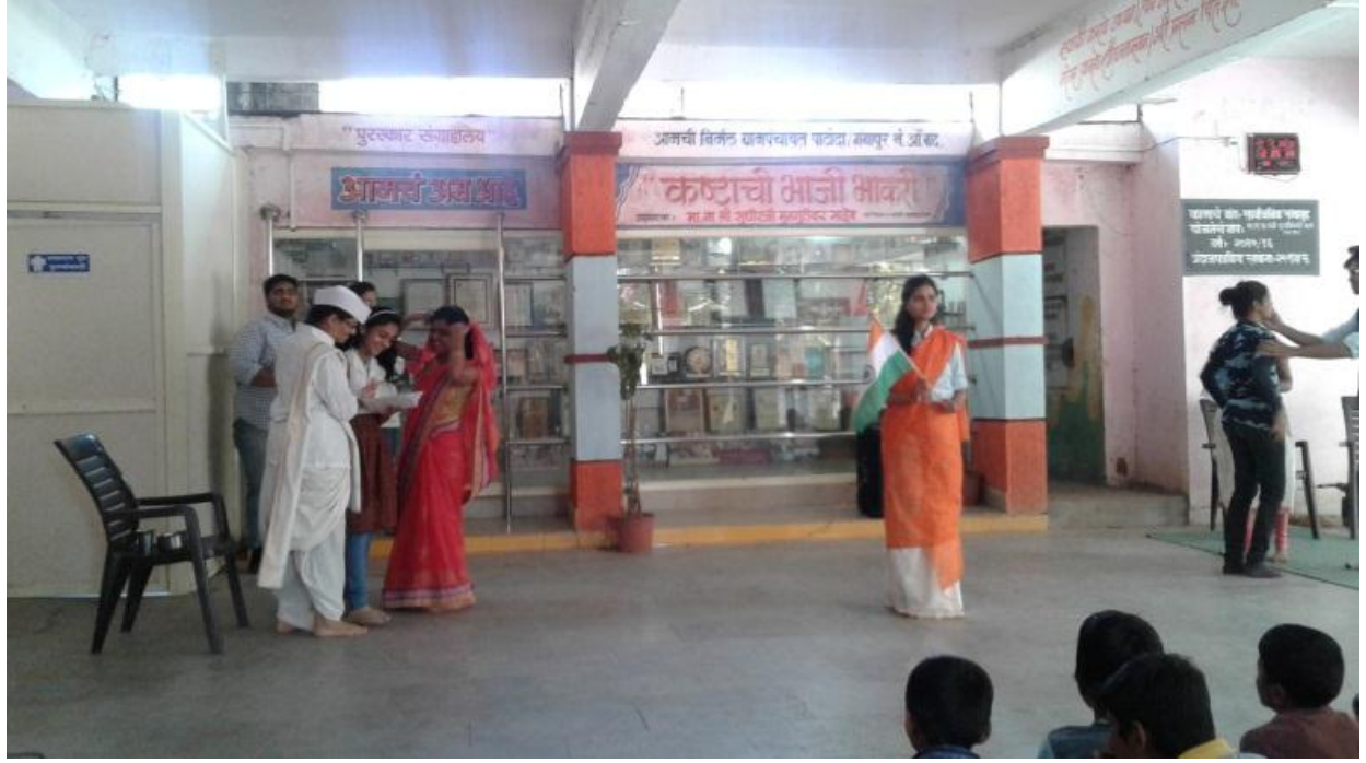
Drama presentation Jai Jawan Jai Kisan 18/02/2018