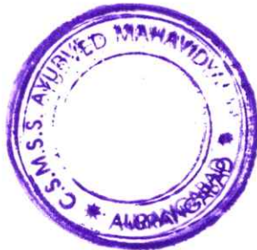
Principal C.S.M.S.S. Ayurved Mahavidyalaya, Kanchanwadi, Aurangabad.

Our CSMSS Ayurved Mahavidyalaya and Rugnalaya had organized Poster competition World AIDS control day on 01/12/2018 at CSMSS Ayurved College & Hospital. 10 Students & 6 Teachers were participated in this event. All participants were benefitted well and they appreciated the event.