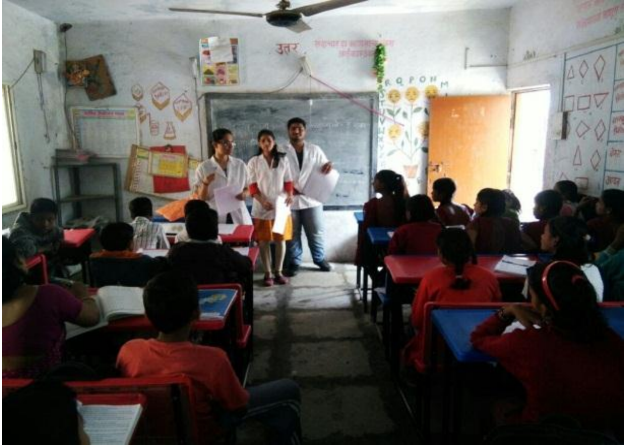
Demonstration of medicinal plants to school childrens 15/02/2018 NSS Special Camp,Patoda village,Dist. Aurangabad