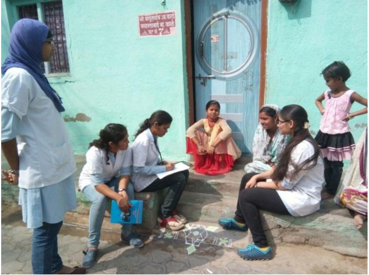
Health & Demographic survey 13/02/2018 NSS Special Camp, Patoda village, Dist. Aurangabad