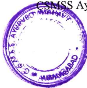
Principal C.S.M.S.S. Ayurved Mahavidyalaya, Kanchanwadi, Aurangabad.

Our CSMSS Ayurved Mahavidyalaya and Rugnalaya had organized Hb Estimation Camp at Dr.Babasaheb Ambedkar Marathwada University Yog Shashtra Dept on 04/08/2018. 6 Students & 3 Teachers were participated in this event. All participants were benefitted well and they appreciated the event.