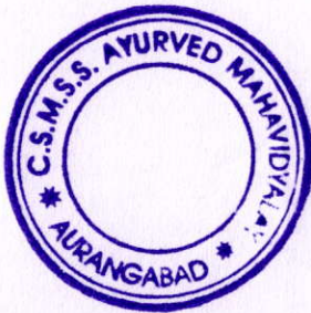
Principal C.S.M.S.S. Ayurved Mahavidyalaya, Kanchanwadi, Aurangabad.

PO11 : Lifelong learning – Transformation and Sustainability of experience based personal or professional knowledge through novel technological change. Always prepared for the epidemics and endemics contingencies and manage the situations effectively on the base of lifelong learning.