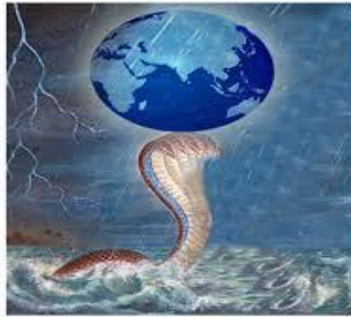
Adi Sesha Supporting the Earth.