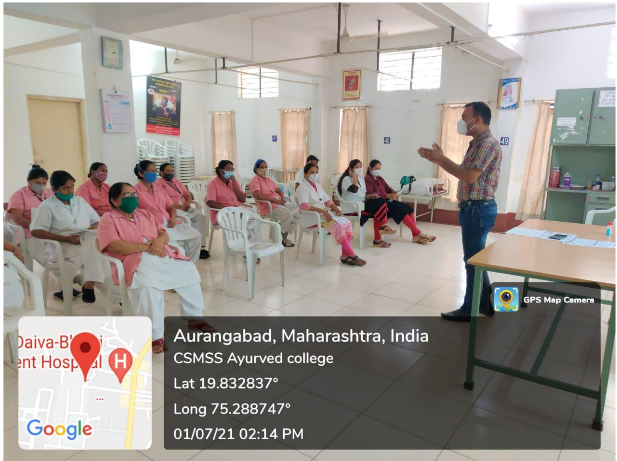
Training program of Vaccination in Infant & Children for Nursing staff